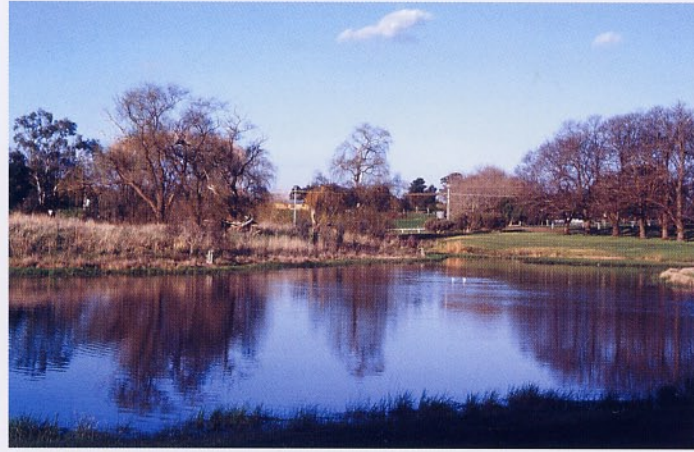
Mortlake's beautiful Tea Tree Lake.